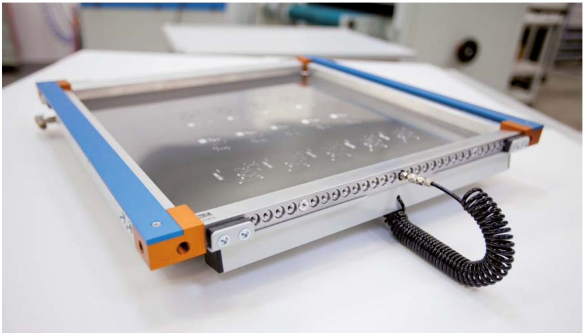
Quattro Flex III with loading unit